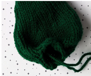
Pic 3. Hole/Gap left for stuffing