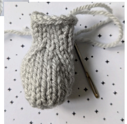
Pic 3. Turn right side out stuff lightly at toe end only for shape