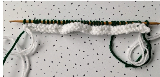
Pic 2. First row of main hat colour.