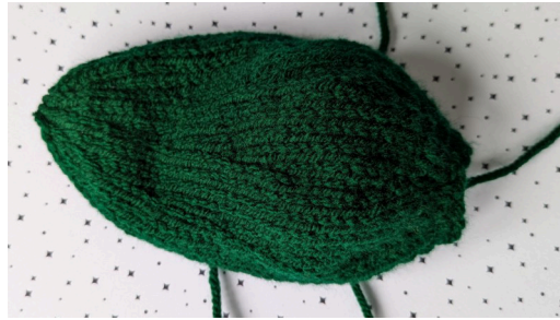
Pic 1. Knitted Body

Fasten off by pulling yarn through the remaining 4 stitches leaving a long tail for sewing.