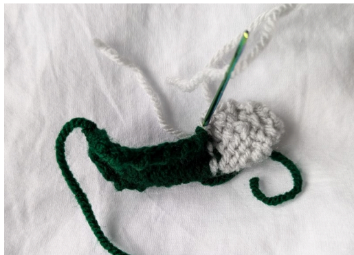
Pic 2. Arm - sew hand seam