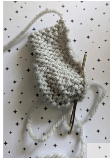
Pic 2. Right sides together seam around bottom to opening.

Turn right side out and stuff the end of the boot lightly to give it shape. ( picture 3 )