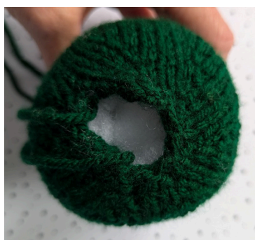
Pic 4. Gather stitches round gap, pull up