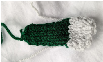
Pic 1. Knitted Arm

Fold just the hand part right sides together and sew a seam just as far as the colour change (dont close the gap completely as you need to turn right side out) see picture 2 . Turn right side out and stuff very lightly just in the end for a bit of shape. Put a stitch using the tail from the colour change just to close the hand – (see picture 3 ).