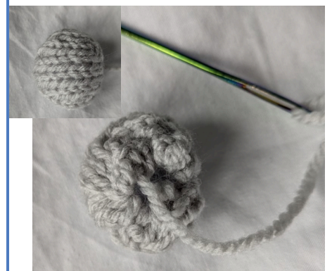
Pic 2. Completed nose