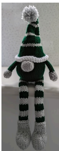
Pic 6. Finished