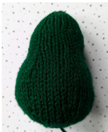
Pic 5.. Completed Body

Fold right sides together and sew a seam almost to the bottom leaving a gap approx. 3/4cm. Turn right side out and stuff. Close the gap by gathering/weaving stitches in a circle (shown in picture 4) pull tightly to close the seam and fasten off. Shape with hands, it should now look similar to picture 5.