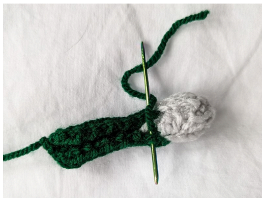
Pic 3. Turn, stuff lightly and stitch to hold