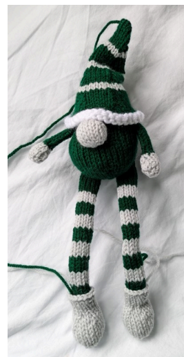
Pic 5. Completed gnome should now look like this.

Let the legs roll naturally and pin to the base of the body. Position them nearer the back. This helps it sit better and the legs dangle, test the sitting position and then sew them to the body.