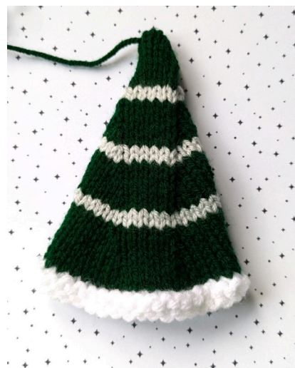
Pic 4. Knitted Hat after seaming and turning out.