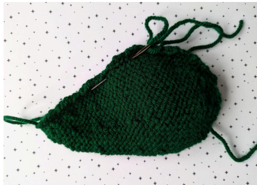
Pic 2. Right Sides together to be sewn