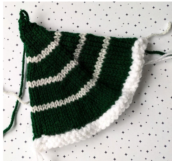
Pic 3. Knitted Hat before seaming.