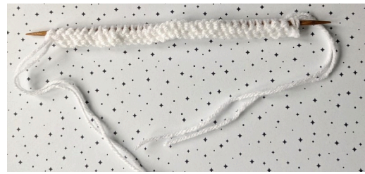
Pic 1. Cast on with 1 row of purl in double stranded yarn.