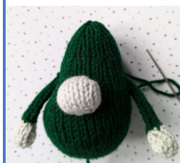
Pic 3. Hat removed to sew in place.