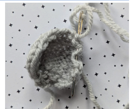
Pic 1. WS facing, gather edge and stuff lightly, pull up tightly to form a ball.

Fold right sides together and sew a seam almost to the bottom leaving a gap approx. 3/4cm. Turn right side out and stuff. Close the gap by gathering/weaving stitches in a circle (shown in picture 4) pull tightly to close the seam and fasten off. Shape with hands, it should now look similar to picture 5.